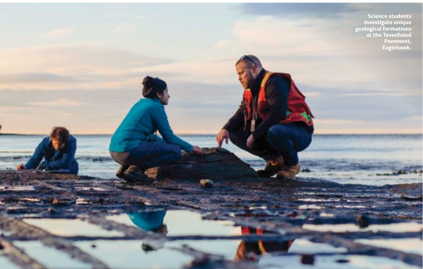
Science students investigate unique geological formations at the Tessellated Pavement, Eaglehawk.

That empowerment is an opportunity for everyone in every role to work with those inside and beyond the University to see Tasmania realise its full potential, to become one of the very special places on the planet, a place that people can look to as a model for how to create a truly sustainable, equitable and prosperous society while preserving the distinctive qualities that make it such a special place.