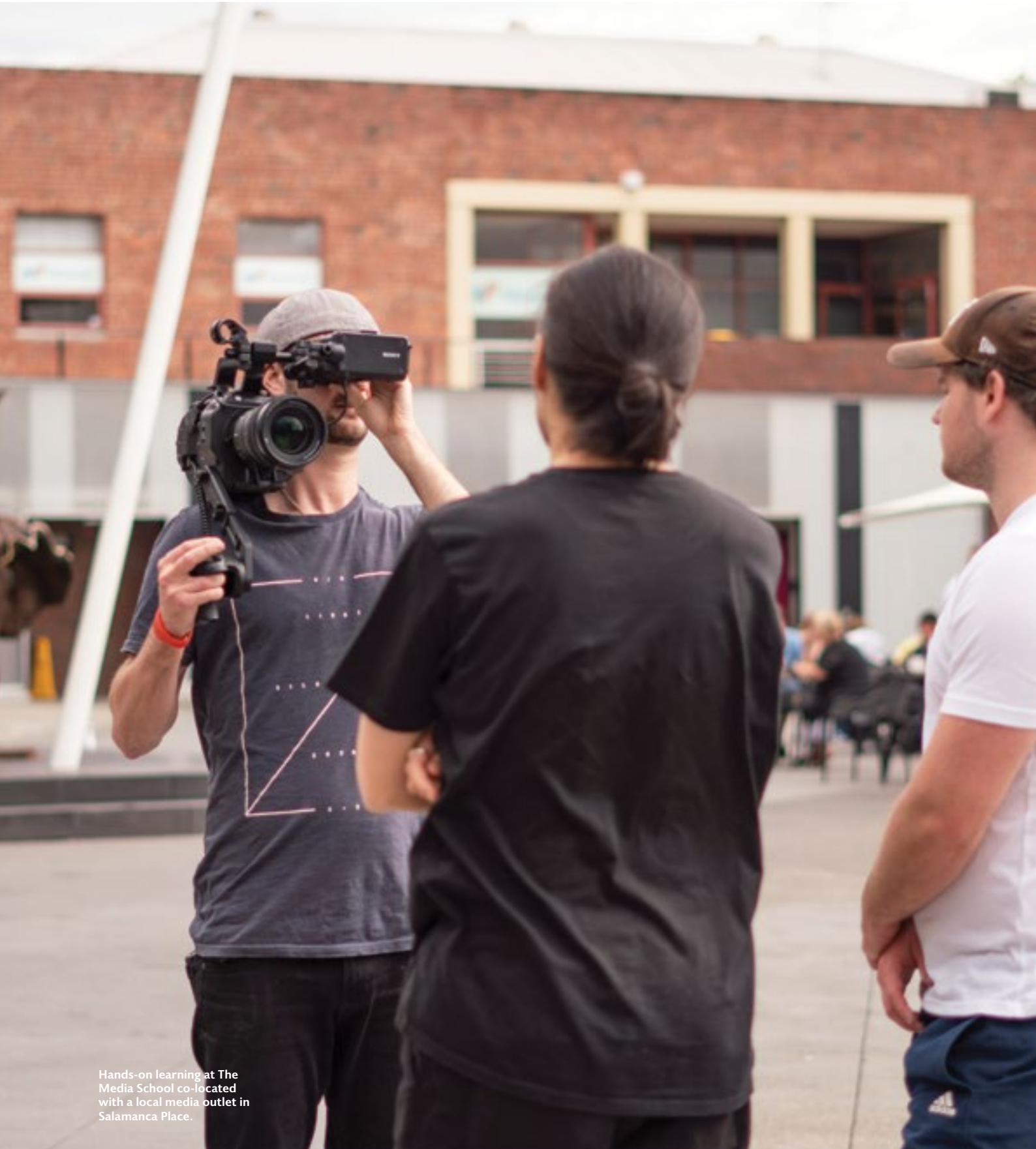
Hands-on learning at The Media School co-located with a local media outlet in Salamanca Place.