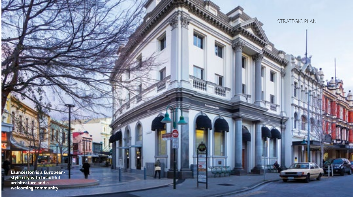
Launceston is a European-style city with beautiful architecture and a welcoming community.

against them, and the definition of a community provided by our island's watery boundaries reminds us that we must work together. Tasmania has environmental values that are of global significance and, as islanders, we have obligations of stewardship. As we think about that stewardship and the broader task of being sustainable, we are guided in our thinking by the United Nations Sustainable Development Goals and the recognition that our job is to find our way to create a model where prosperity, inclusivity, the environment and social and technological progress advance together, not in tension. In those places where we work off-island, whether it is in Sydney or Shanghai, we bring our island values, values that our planet urgently needs.