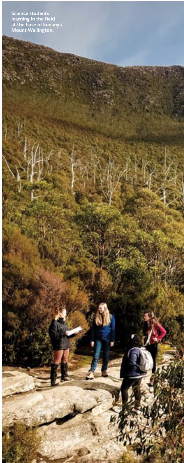
Science students learning in the field at the base of kunanyi/ Mount Wellington.