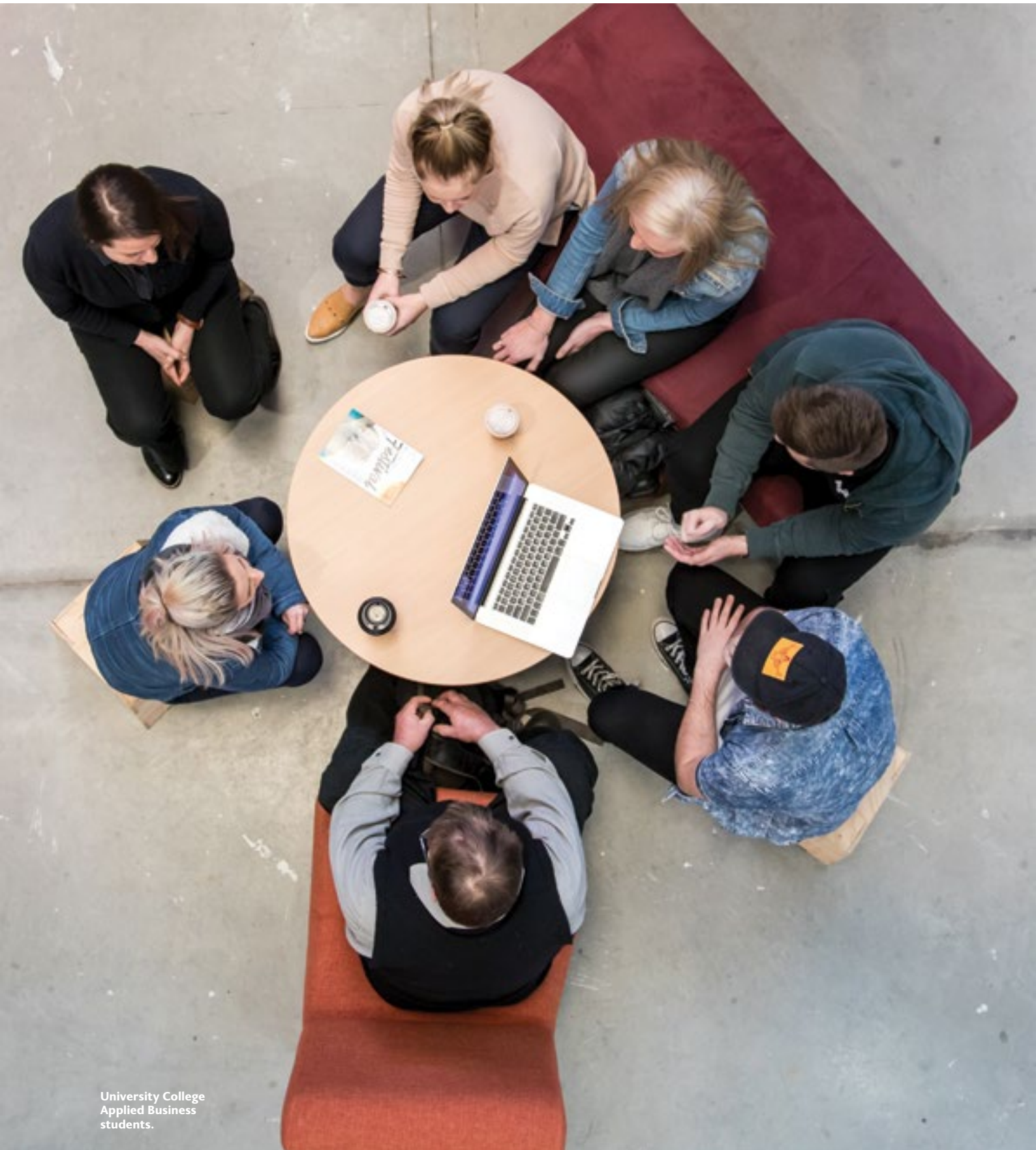
University College Applied Business students.