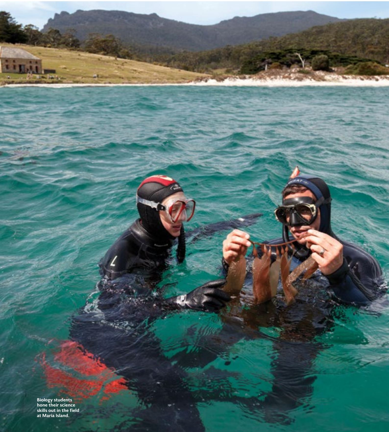
Biology students hone their science skills out in the field at Maria Island.