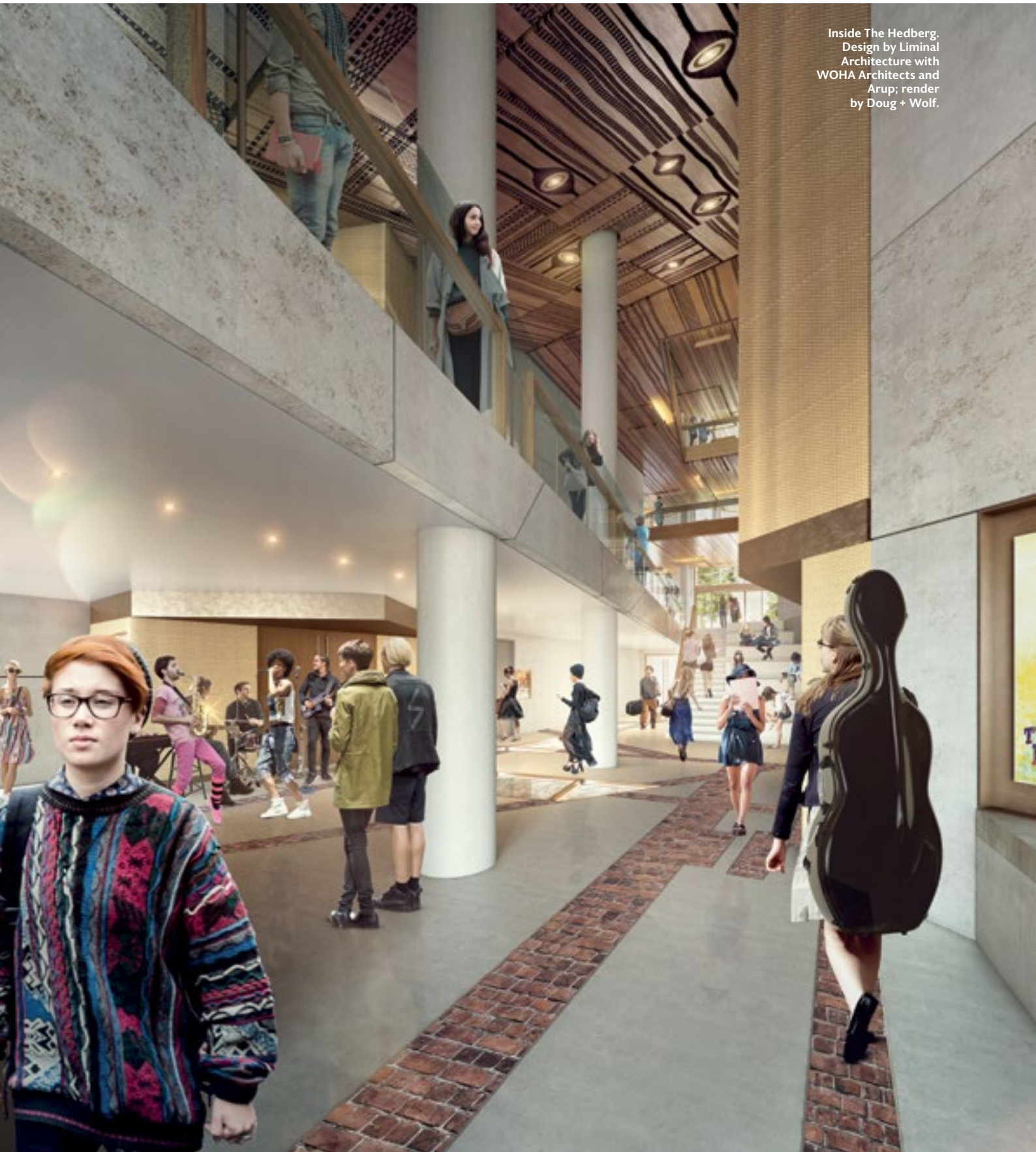
Inside The Hedberg. Design by Liminal Architecture with WOHA Architects and Arup