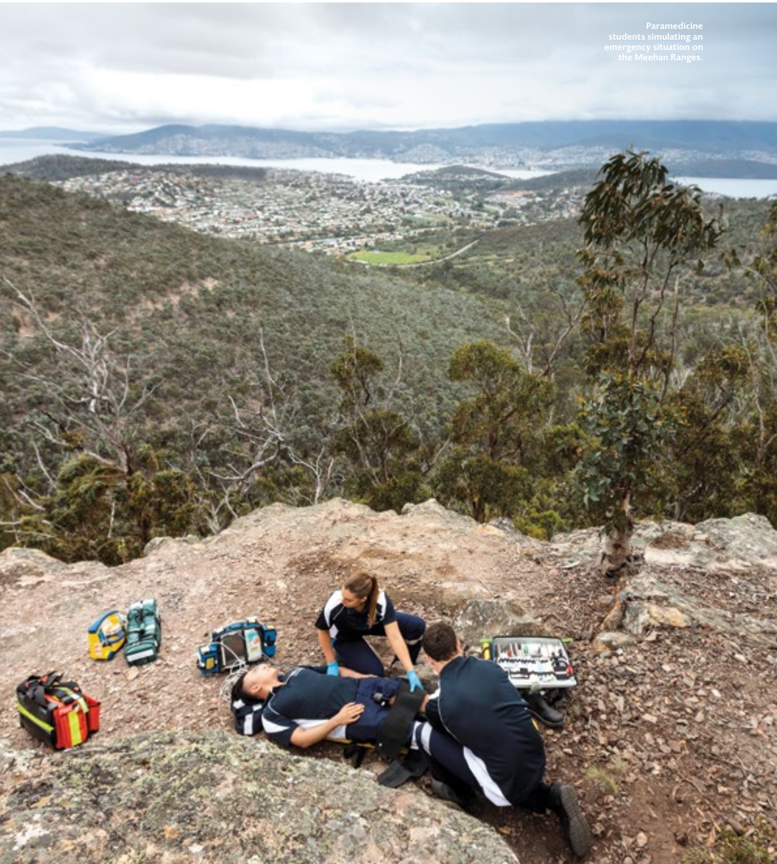
Paramedicine students simulating an emergency situation on the Meehan Ranges.