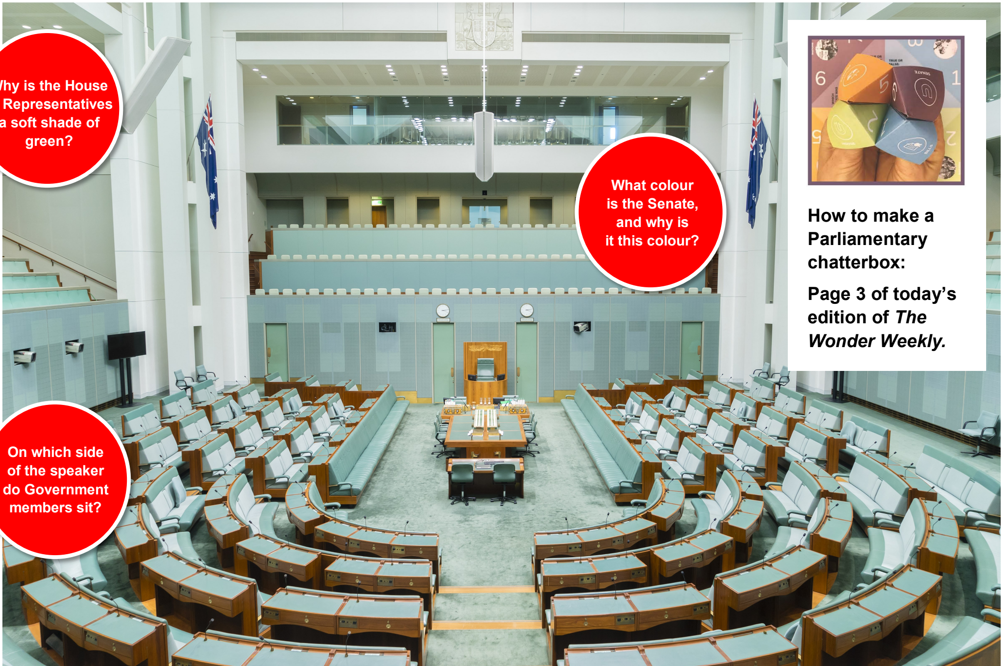
ORDER IN THE HOUSE: The House of Representatives at Parliament House in Canberra. The Speaker sits in the raised chair in the middle of the U-shaped room.

On which side of the speaker do Government members sit?