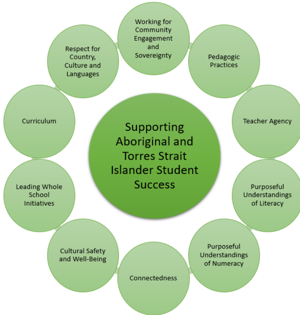
Figure 1: The Ten Supports