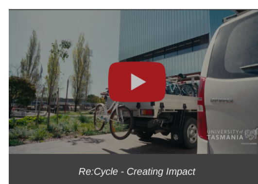
Re:Cycle - Creating Impact

Re:Cycle is a small program with a big impact, a partnership between the University of Tasmania (UTAS) and Big Picture School in Launceston. Big Picture students are taught how to repair abandoned bicycles for either donation or sale to the community.