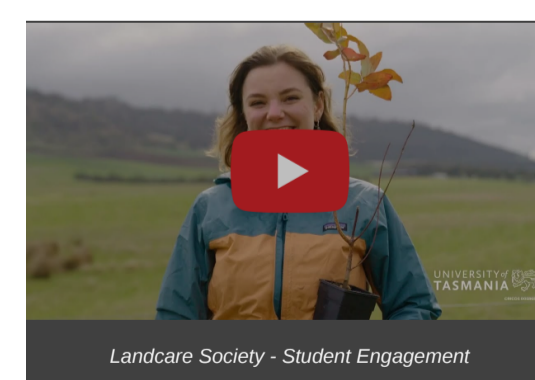
Landcare Society - Student Engagement

The Landcare Society is an initiative that connects students with volunteer land management and restoration opportunities across Tasmania, to create resilience in our landscapes and in our communities.