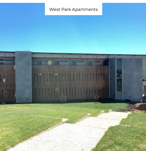
West Park Apartments

*Costs listed are per week for 2024 and are subject to change and NRAS eligibility. Refer to the website for the most up-to-date information.