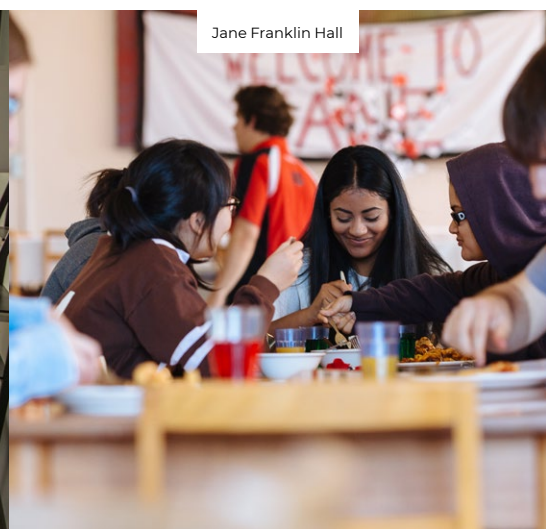
Jane Franklin Hall