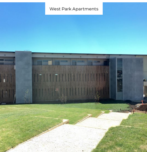
West Park Apartments

*Costs listed are per week for 2025 and are subject to change and NRAS eligibility. Refer to the website for the most up-to-date information.