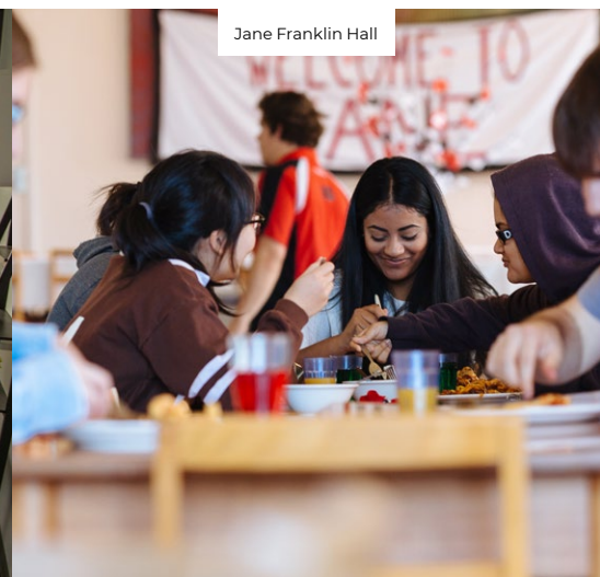
Jane Franklin Hall