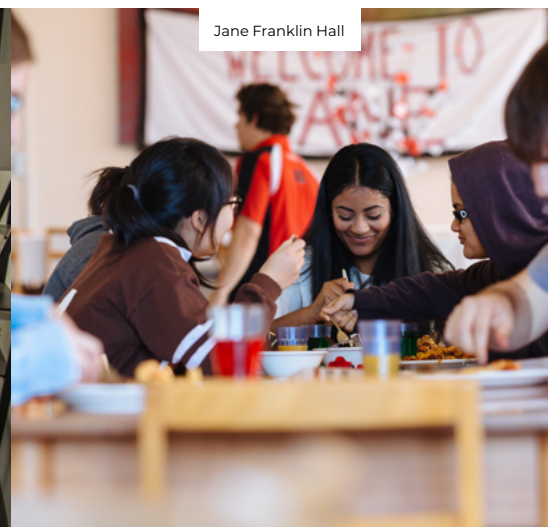
Jane Franklin Hall