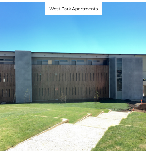
West Park Apartments

*Costs listed are per week for 2024 and are subject to change and NRAS eligibility. Refer to the website for the most up-to-date information.