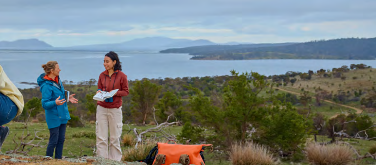
▲ Outdoor and Environmental Education students, Tasman Peninsula