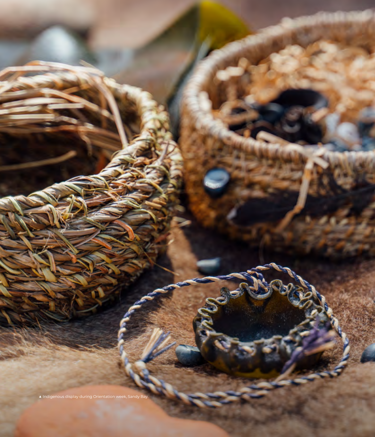
▲ Indigenous display during Orientation week, Sandy Bay.

We acknowledge the Palawa/Pakana people of Lutruwita (Tasmania) and the Gadigal people of Sydney, the traditional owners, and custodians of the land upon which we live and work. We pay respects to Elders past and present as the knowledge holders and sharers. We honour their strong culture and knowledge as vital to the self-determination, wellbeing, and strength of the community. We stand for a future that profoundly respects and acknowledges Aboriginal perspectives, culture, language, and history.